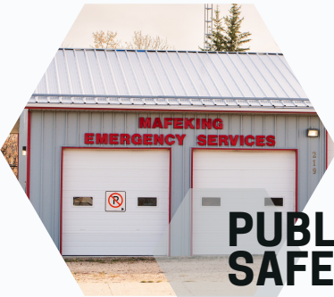
PUBLIC HEALTH & SAFETY